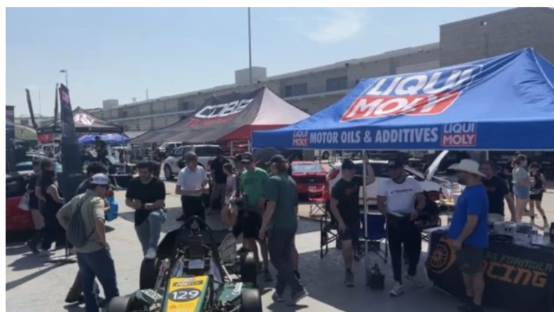
Super Lap Battle (Austin, TX)

Thanks to everyone that showed their support at Super Lap Battle and SCCA Autocross this month. Stay tuned for more upcoming events!