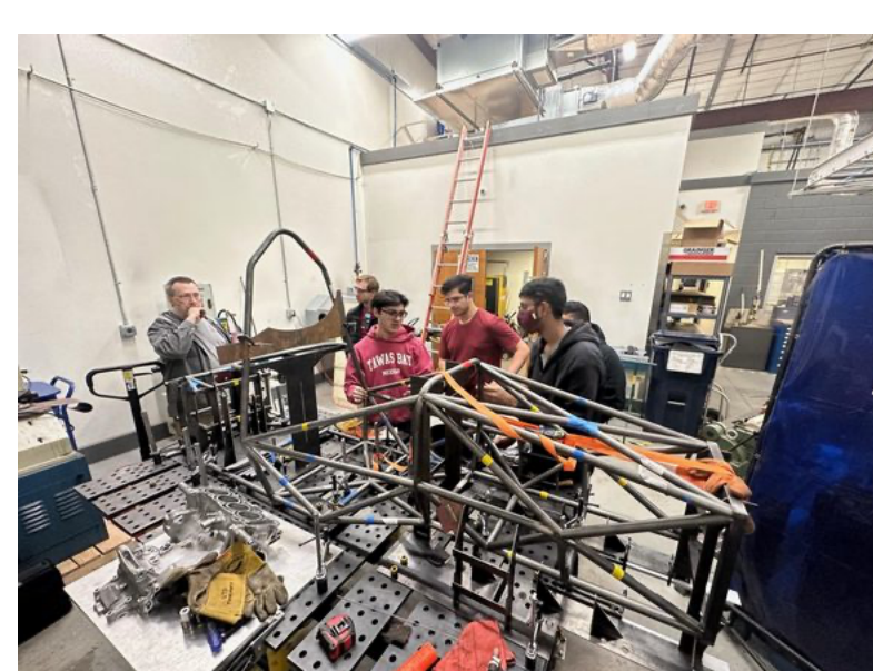
The manufacturing team discussing whether to weld or adjust the fit of one of the bars on the chassis