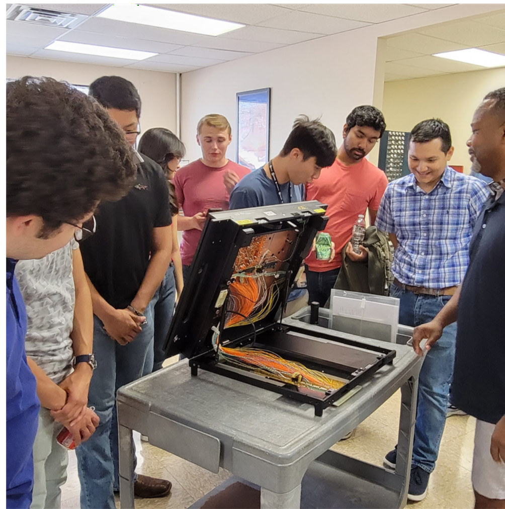
The team touring Test Technologies in October (Carrollton, TX)

Thank you to Test Technologies for your generous donations and for your continued partnership this year. Our team has enjoyed learning more from the brightest minds in the community and we are excited to continue to work together in the future!