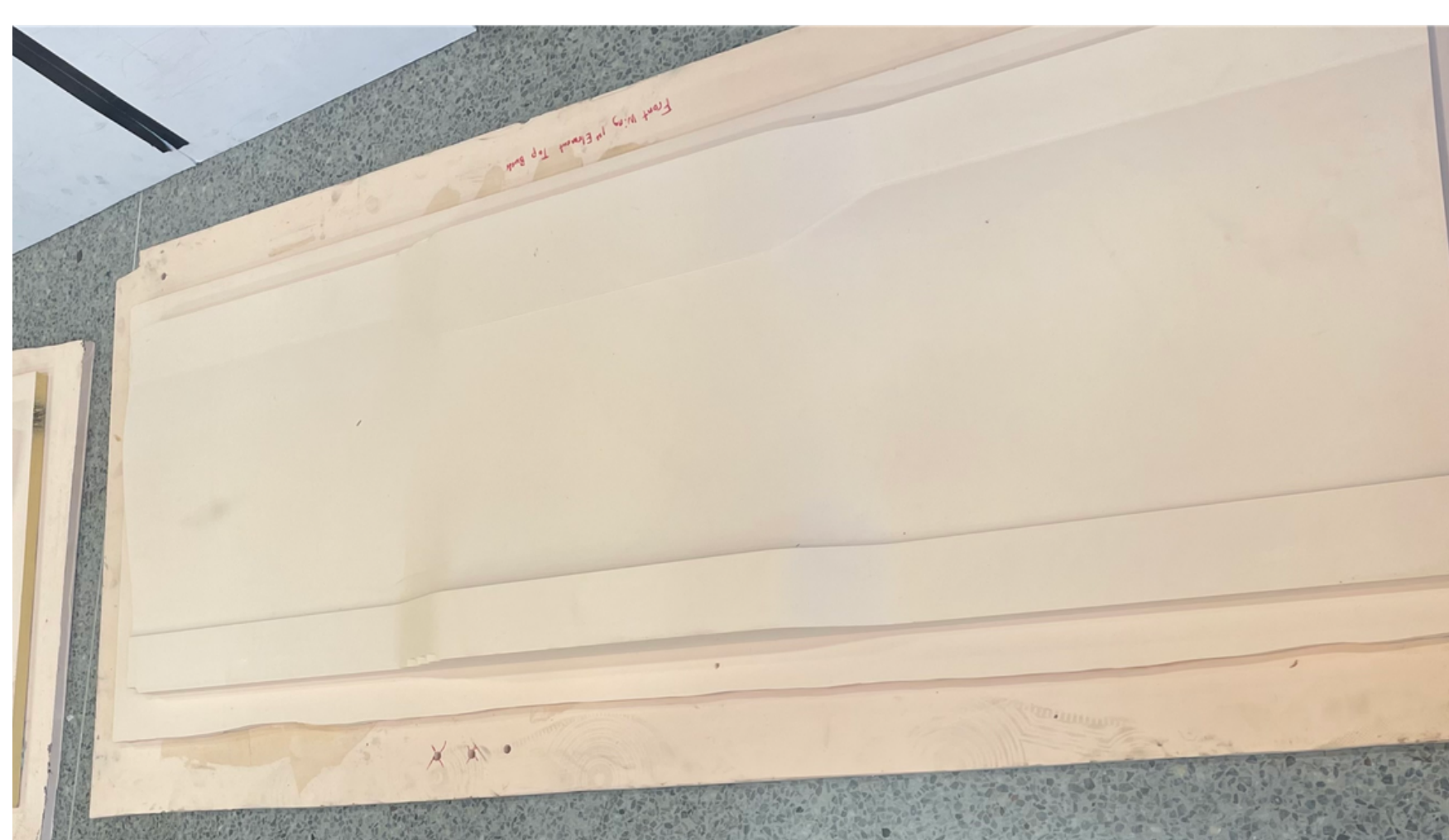
One of the front wing molds

Our composites team is laying up the front wing and infusing them with carbon fiber & epoxy resin for our 2023 vehicle. We are delighted to have recently completed a portion of the main front wing component, and we are confident that the results will be outstanding.