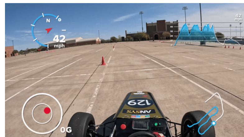
SCCA Autocross (Burleson, TX)